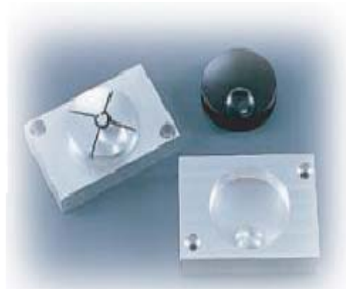
Tooling board and aluminium parts produced on a benchtop Roland MDX540