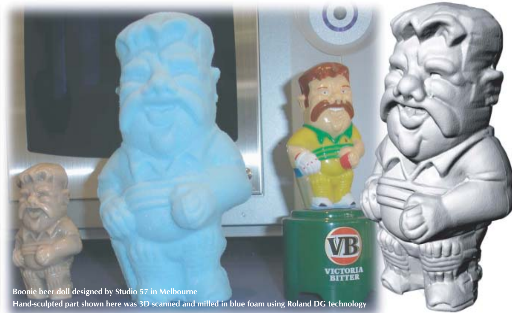
Boonie beer doll designed by Studio 57 in Melbourne Hand-sculpted part shown here was 3D scanned and milled in blue foam using Roland DG technology