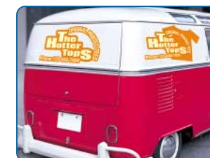
Eye-catching vehicle graphics