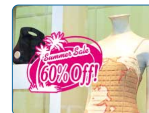
Beautiful window displays