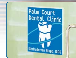
Professional indoor signs and labels

(5) Adobe® Illustrator® 7/8, CorelDRAW® 8