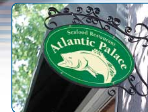
High-quality outdoor signs